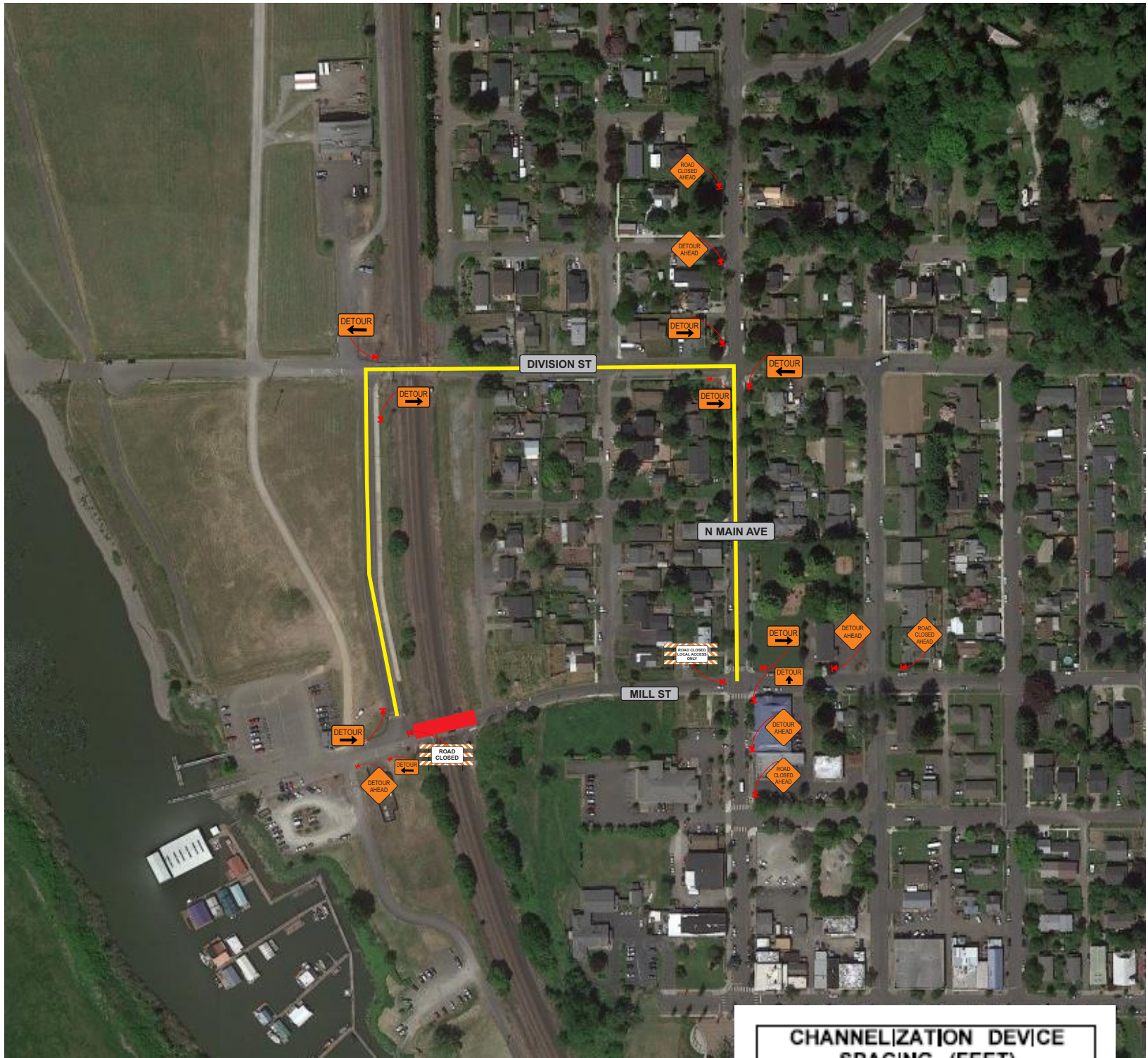
Road closure and detour for Mill St.